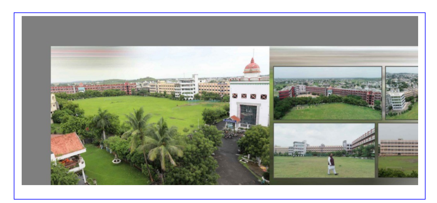
NSS Activity SSPACE